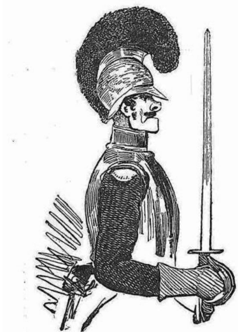
Figure 1 'The Dragoon', Bell's Life in London , 12 April 1835

The Digest of Services of the King's Dragoon Guards records that they were stationed in a variety of locations throughout the region in late-May 1835: